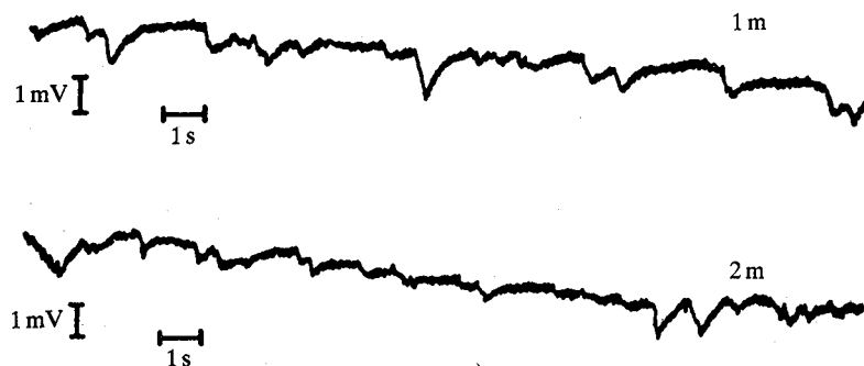
Fig. 3. Electroantennogram recordings of an isolated Antheraea polyphemus antenna positioned 1 m or 2 m downwind from the pheromone source.

tended to expand slightly during its down-tunnel movement. Such induced turbulences are common in nature. At 1 m from the pheromone source the antenna responded with depolarizations (bursts) of 1.13 \pm 0.83 s ( \pm s.d., averaged over 53 s; burst detection threshold was 0.2 mV) (Fig. 3). The burst frequency was similar at 2 m 1.09 \pm 0.9 s (averaged over 70 s). A male with two antennae, instead of the one used for these EAGs, would span approximately 3 cm and probably encounter plume filaments at a somewhat higher frequency because of the doubled antennal area presented. Likewise, males flying at 80 \text{ cm s}^{-1} air speed instead of being stationary as with the EAG preparation (where air speed was 50 \text{ cm s}^{-1} ) should encounter filaments at approximately a 50% higher frequency, or approximately 1.6 \text{ bursts s}^{-1} . Such an increase in burst frequency with air speed has been observed in EAGs from the moth Grapholita molesta , where the antennae were pushed at various velocities directly upwind in a pheromone plume (T. C. Baker & K. F. Haynes, unpublished results).