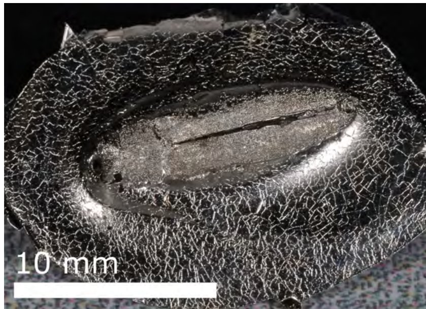
Figure 3. Photograph of the \sim 100 - \mu\text{m} -thick negative die of the EAB specimen of Fig. 1. The sunken region in the photograph had housed the biotemplate during electroforming.