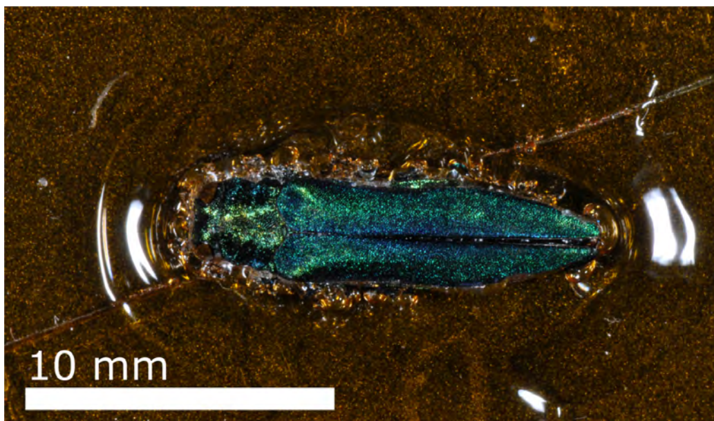
Figure 1. Photograph of an EAB specimen mounted on a glass slide with PDMS. The PDMS mounting allows for a smooth transition between the surface of interest and the glass slide.