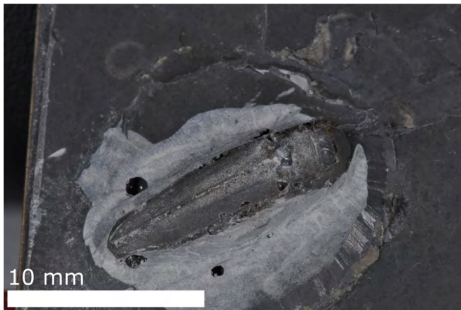
Figure 5. Photograph of the positive epoxy die fabricated.