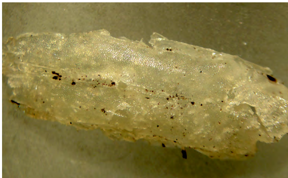
Figure 6. Photograph of a partial decoy made of PET.

In the absence of colored polymer sheets described in Sec. 1, artificial decoys—of neither the right color nor the right materials—were made of poly(ethylene terephthalate) by interposing a PET sheet between the positive and negative dies. Both dies were heated on a hot plate above the melting temperature (about 250 °C) of PET. After sufficient time had elapsed for the dies to reach the desired temperature, a PET sheet was melted into the negative die. With a pool of molten PET in the negative die, the positive die was pressed into the negative by hand. The positive and negative dies were removed from the hot plate together and set aside to cool. Once cooled, the dies were separated. Then the PET replica was removed from the negative die. Figure 6 shows a PET replica which is a visual “decoy”—but only in part because it does not have the right color.