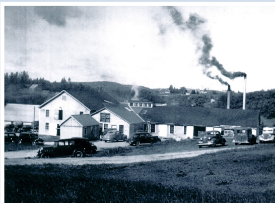
Wyman's Cherryfield, Maine facility, mid 1940s.