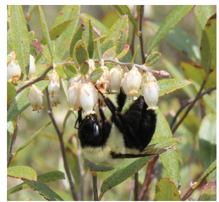
Bumble bee buzz pollinating blueberry flowers

For example, squash bees ( Peponapis pruinosa ) feed almost exclusively on cucurbit flowers. Other bees are