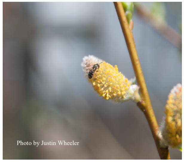
Bee enjoying pollen and nectar from male catkins of American pussy willow

The pussy willow is dioecious (die A shus) meaning that male and female parts are found on different plants. The male plants have larger, showier catkins. The catkins are the soft grey fur of the pussy willow that forms a warm protective layer around the flower. The female plants tend to have catkins that are smaller and greener. The fuzzy "fur coats" are the flowers that keep the reproductive parts of the plant warm. Hummingbirds use the fuzzy softness to line their nests. The early March catkins provide one of the first-of -the season nectar sources for pollinators. You know you have a male plant when the catkins begin to look yellow. This is the pollen on the tips of the anthers. The willow can be pollinated by the wind and by insects that are drawn to its strongly scented nectar.