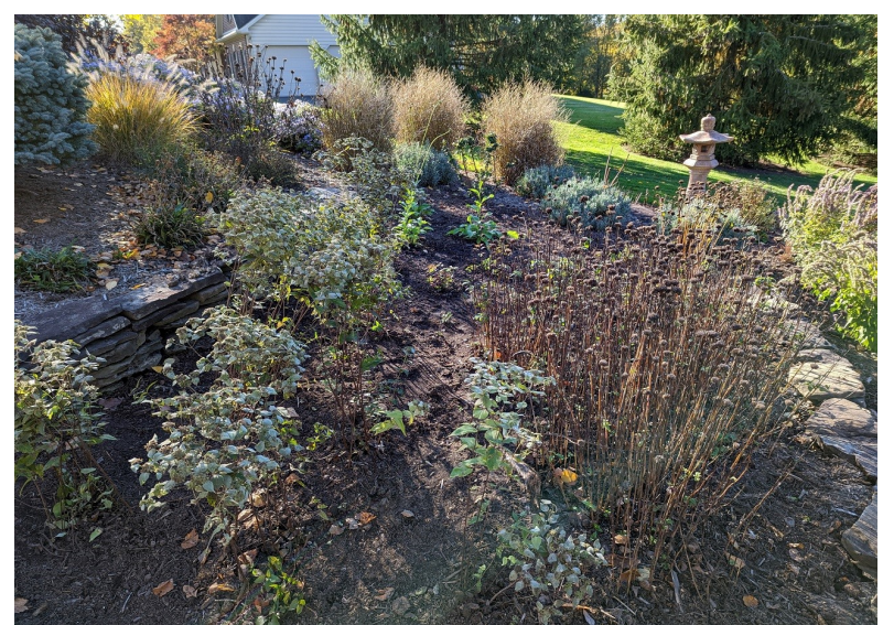
Preston tier garden after creating larger drifts of plants

I am very excited about the small white oak ( Quercus alba ) tree that we have planted this year. According to Dr. Tallamy, there is no other plant that will bring in the number of caterpillars that a white oak will. That means lots of pollinators here to lay the caterpillar eggs and lots of birds here to eat the caterpillars. I have pollinator plants in bloom through every season and if I plant something that seems to have low value to pollinators or wildlife, I willingly remove it to plant something more useful to them.