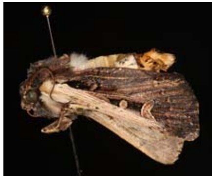
Fig. 1. Male western bean cutworm moth captured in Franklin Co., PA, 2009.

The western bean cutworm [ Striacosta albicosta (Smith); Noctuidae] (Fig. 1) is a lepidopteran species native to western North America; however, this occasionally serious pest of corn ( Zea mays L.) and dry beans ( Phaseolus vulgaris L.) has been expanding its range eastward (1,2,3,4). From 1998 to 2004, it was reported invading Minnesota, Illinois, and Missouri (2,3,4). Moths were first reported from Indiana in 2005, Wisconsin, Michigan, and Ohio in 2006 (2), and in Ontario, Canada, as well as Wayne Co., OH, less than 150 km from Pennsylvania, in 2008.