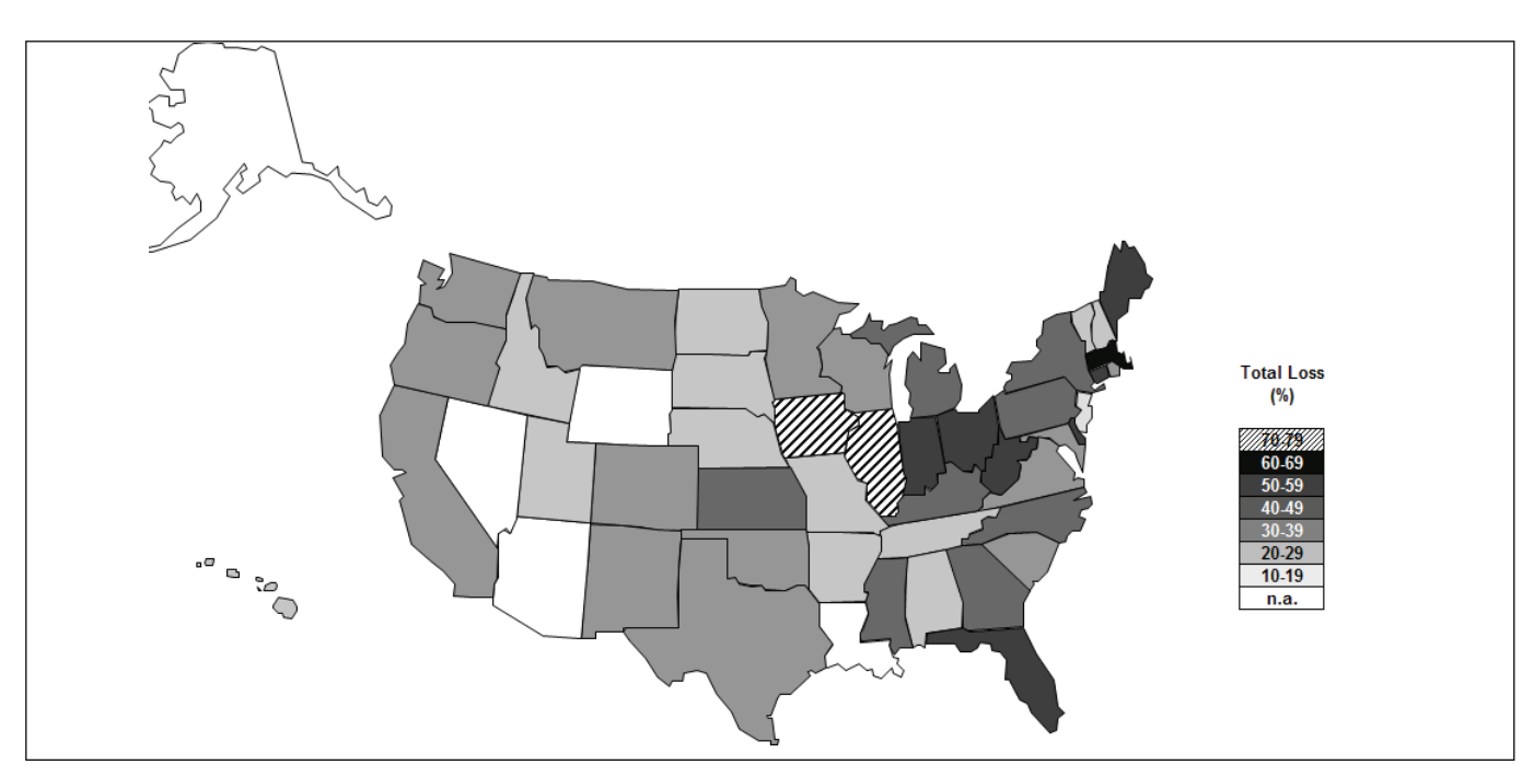
Fig. 2. Total colony losses by state. Operations who reported managing colonies in more than one state had their losses included in all of the states in which they reported managing colonies (see Table 1). States which had fewer than six responders (n.a.) are not included.