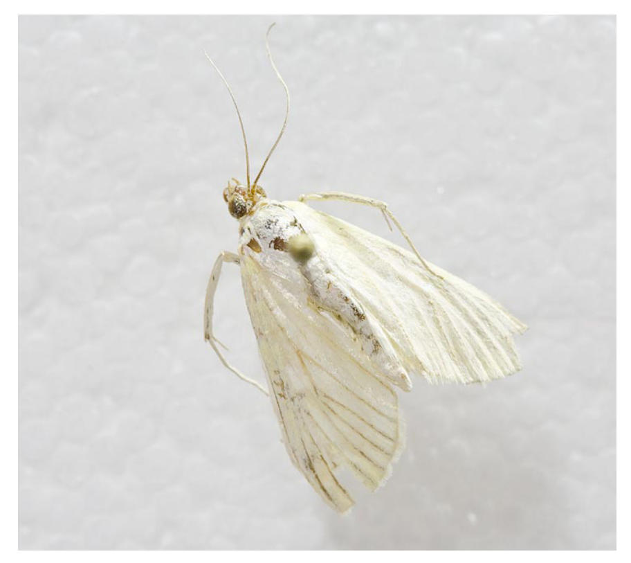
Figure 1. S. palealis (mounted specimen) collected from Centre County, Pennsylvania during 2011.