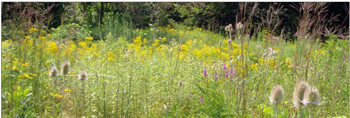
Figure 1 Hedgerow plantings for pollinators can serve other functions, such as habitat for wildlife or beneficial insects. The pollinator habitat featured below includes a diverse mix of native forbs, grasses, trees, and shrubs—providing a variety of forage and nesting sites for native bees and wildlife throughout the year.