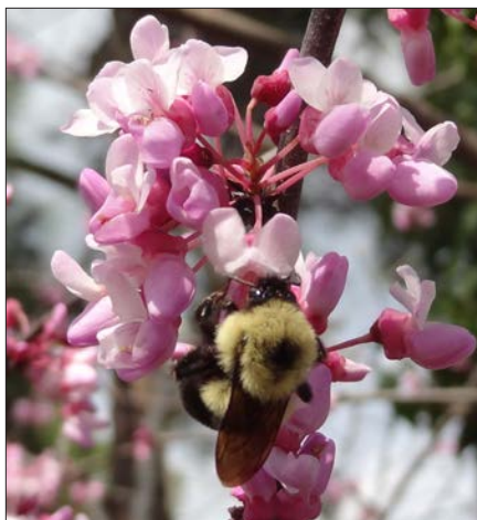
Figure 8 Many species of native bees—such as bumble bees—emerge very early in the spring, which is why it is essential to include plants that bloom early in the season. From left to right: eastern redbud ( Cercis canadensis ) 1 , American holly ( Ilex opaca ) 2 , and pussy willow ( Salix discolor ) 3 bloom in early to mid-spring.