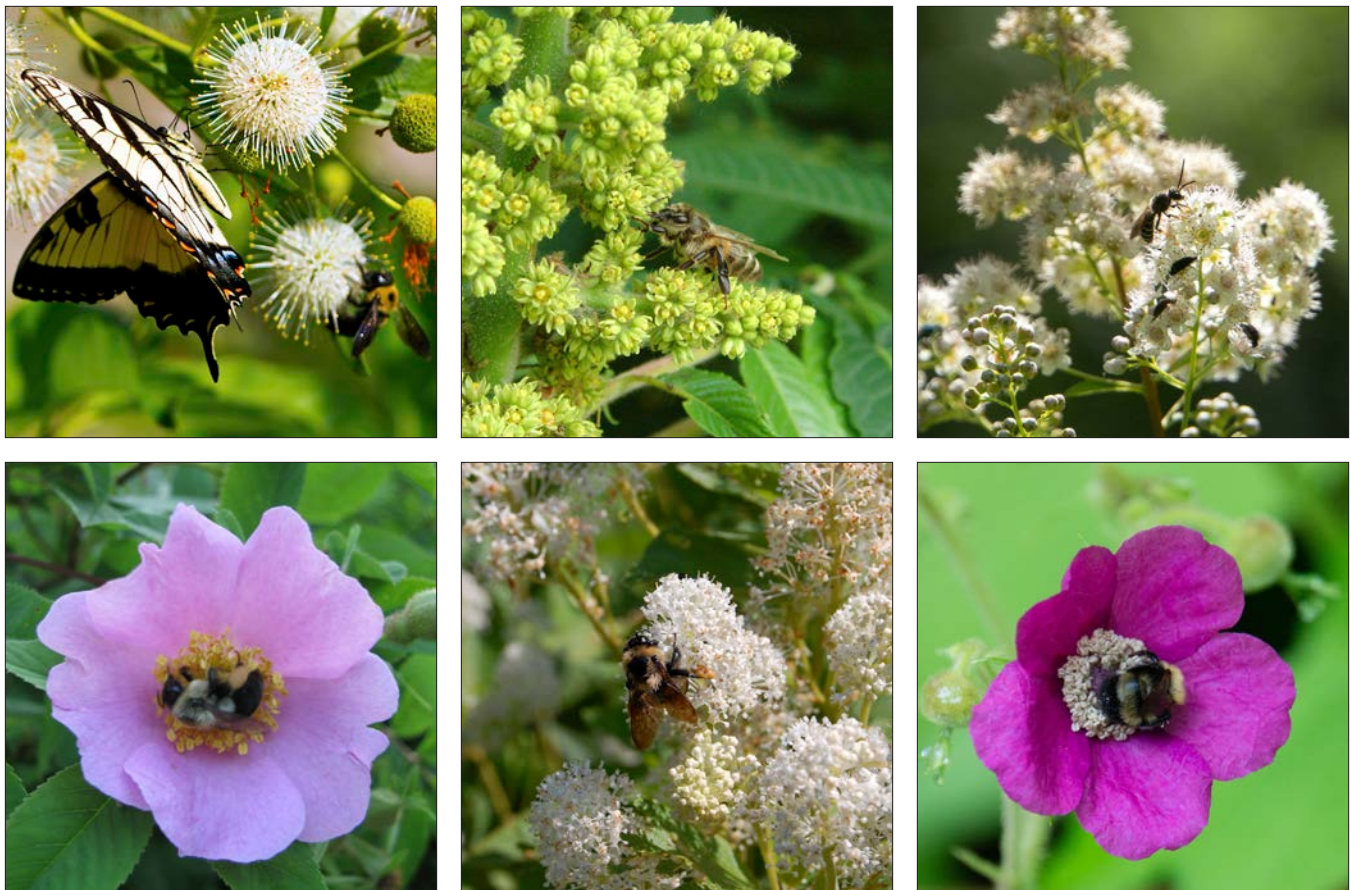
Figure 9 When installing pollinator habitat, it's important to include floral resources that will bloom later in the season, after the peak bloom period for many other pollinator plants and crops. Clockwise from top left: buttonbush ( Cephalanthus occidentalis ), white meadowsweet ( Spiraea alba ), staghorn sumac ( Rhus typhina ), purple-flowering raspberry ( Rubus odoratus ), New Jersey tea ( Ceanothus americanus ), and swamp rose ( Rosa palustris ).