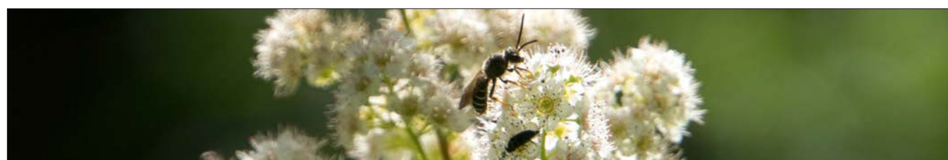
Figure 3 Native bee foraging on white meadowsweet ( Spiraea alba ). A mid- to late-spring blooming shrub, white meadowsweet attracts a variety of pollinators and beneficial insects—particularly beetles and solitary wasps.