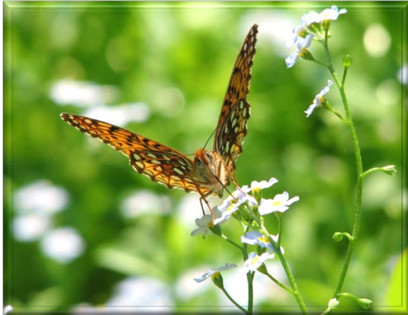
Atlantis Fritillary ( Speyeria atlantis ) on forget-me-nots ( Myosotis sp.)