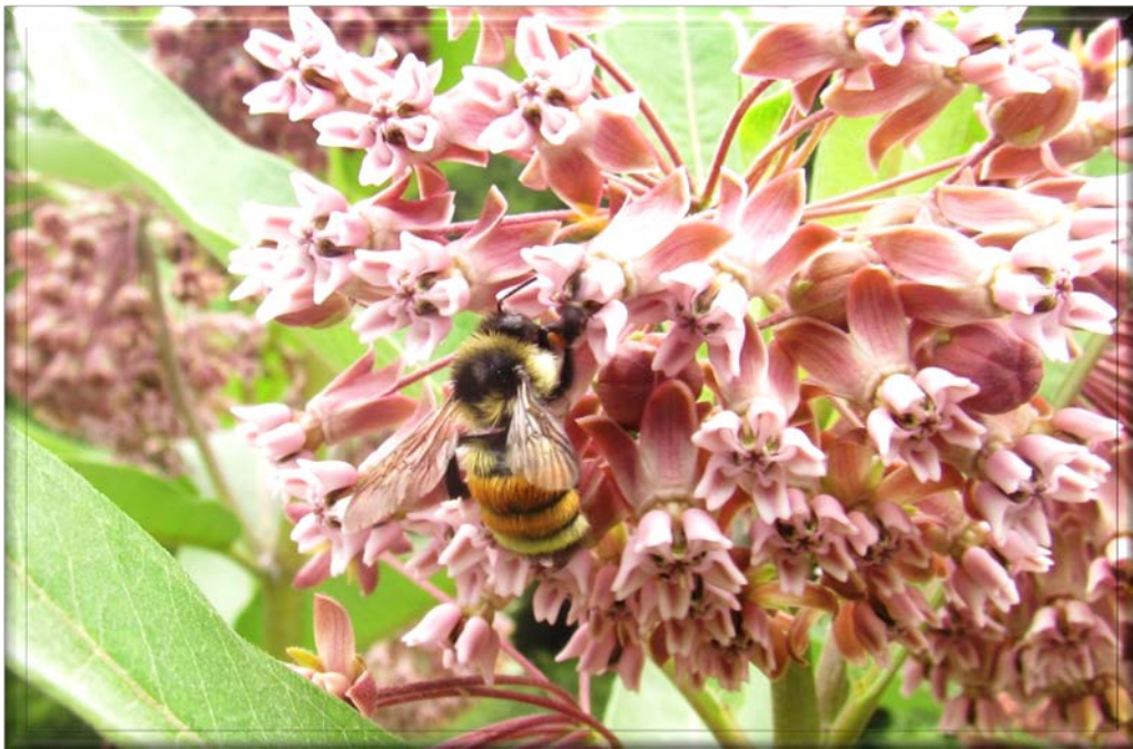
Tri-colored bumble bee ( Bombus ternarius ) on common milkweed ( Asclepias syriaca )