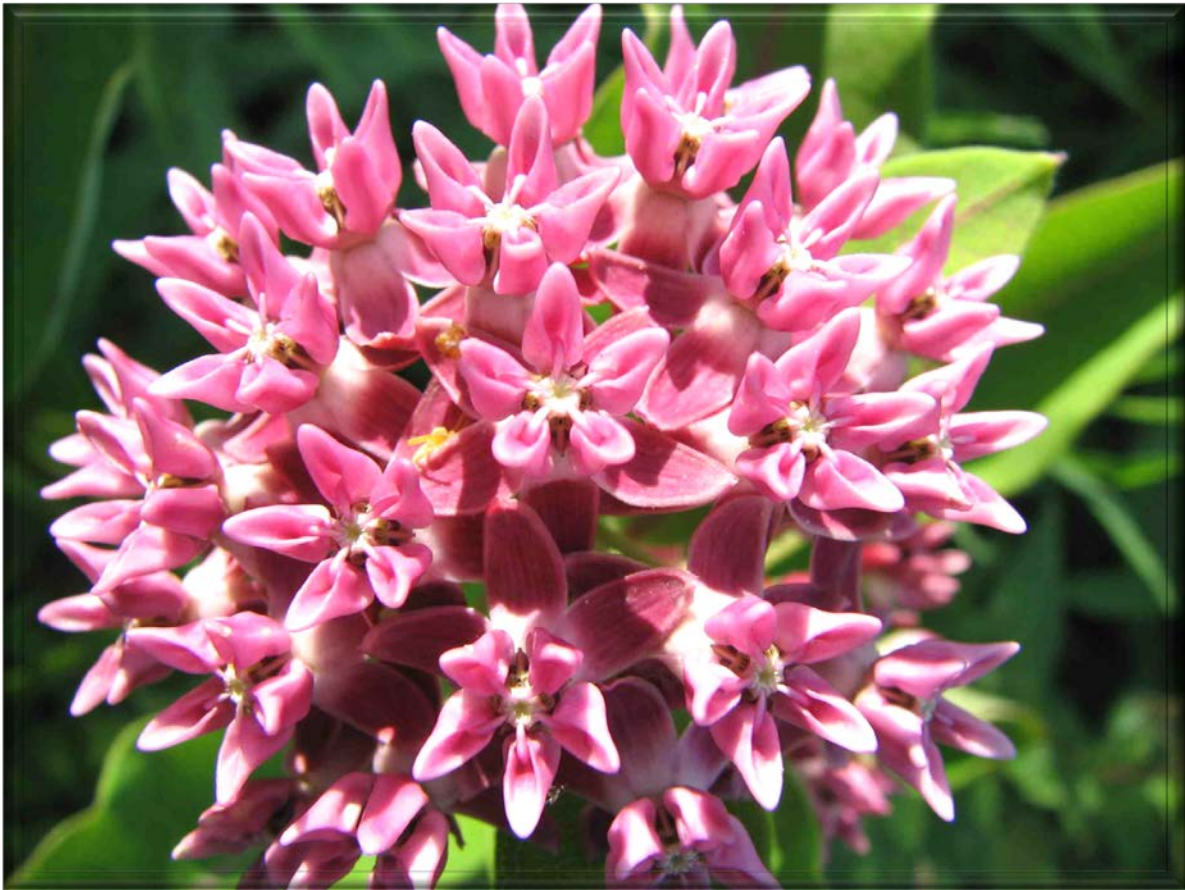
Milkweeds such as this purple milkweed ( Asclepias purpurascens ) are a favorite nectar plant for many pollinators.