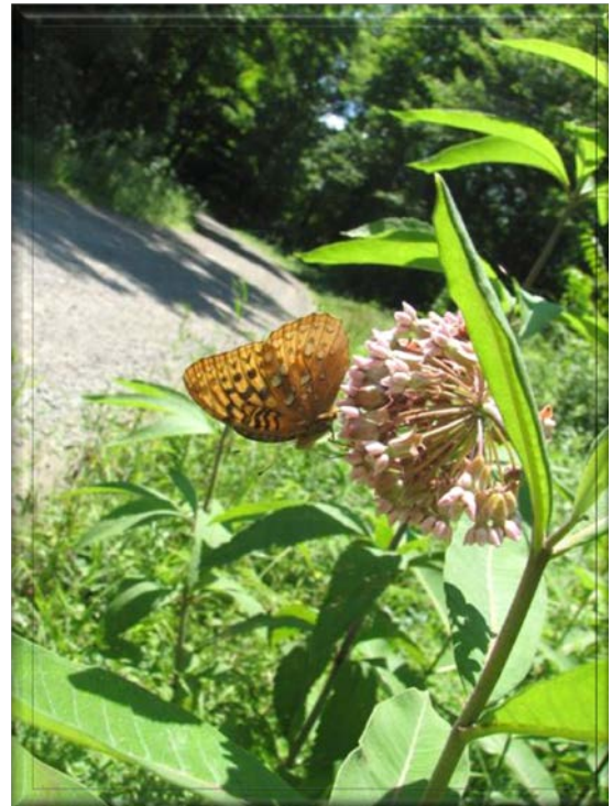
A great spangled fritillary ( Speyeria cybele ) feeds on common milkweed ( Asclepias syriaca ) along a roadside.

Good pollinator habitats come in many shapes and sizes, including backyard gardens, old fields, wetland complexes, forest glades, shady woodlands, and floodplains. Each habitat supports a unique combination of flowering plants that appeal to different pollinators. Right-of-ways, roadsides, field edges, hedgerows, ditches, and other infrequently mowed areas can support nectar plants and nesting sites. These areas are often degraded by herbicides, road treatments, vehicle traffic, and poorly timed mowing, but they may still be a critical source of food if nectar resources are lacking elsewhere.