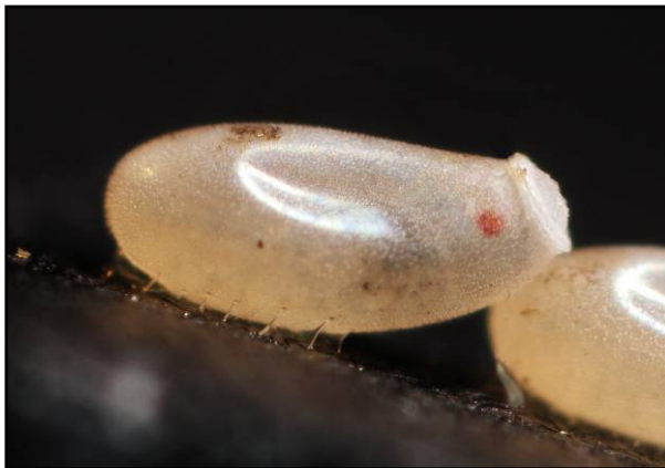
Figure 6. Bed bug eggs are glued down when laid, which means that they resist removal via vacuuming.

The Pest Manager should be aware of the limitations of vacuuming. All previously vacuumed areas need to be treated with insecticides as bed bugs within crevices can hold on against the suction forces. The eggs themselves are glued in place when laid and resist removal via vacuum (Figure 6), meaning that other control measures must be subsequently applied.