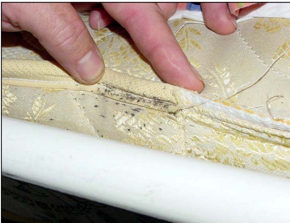
Figure 2. Blood spotting on a mattress, which is typically grouped, indicating the gregarious nature of the insect. No bed bugs can be seen in this image.