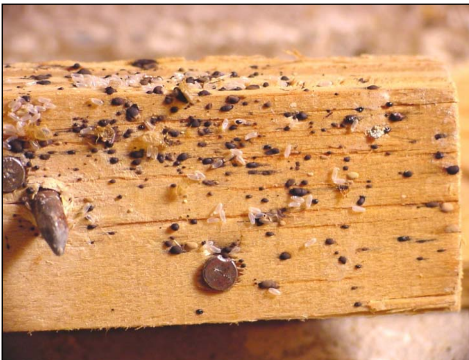
Figure 4. The 'straight edge' that holds the carpet in place. Numerous eggs and blood spotting are evident. For more bed bug related images see Doggett (2005).