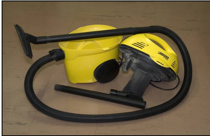
Figure 5. Vacuums such as this 'wet & dry' unit are ideal for bed bug control. All surfaces that may come into contact with bed bugs (such as the base and hoses) are composed of solid plastic and can be readily sterilised post use with very hot water. Importantly, this vacuum also uses disposable bags.

It is important that the vacuum machine does not become the source for further infestations so it must be properly 'disinfected' following use. Vacuum units that have the base and all hoses composed of solid plastic can be readily sterilised in hot water (Figure 5). This should be done as soon as possible after use. When not in use the vacuum unit itself should be stored in a sealed bag.