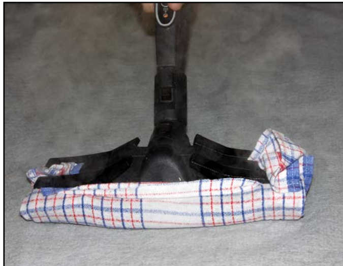
Figure 7. Covering the steam head with cloth will ensure that bugs will not be blown about, yet the temperature will be high enough to kill the insects.

Steam flow rate must be kept to a minimum to avoid blowing bed bugs about (along with exuviae which may contain eggs and nymphs) and to reduce wetting. Likewise, single jet steam nozzles can blow bed bugs away. If such nozzles are used on mattresses then the nozzle should be always pointed towards the centre of the mattress where propelled bugs can be seen and re-steamed if still alive. Multiple jet steam heads produce a gentler flow rate, are thus less likely to blow bed bugs away and can treat larger areas over a shorter period. In comparison for example, with single jet nozzles it will be necessary to run the nozzle along both sides of edge beading, whereas a single pass with a multiple jet head placed over the beading will usually suffice. By placing a cloth over the steam head as in Figure 7, bed bugs will not be blown about by the jets and the treated surface becomes much hotter, which better guarantees the killing of all stages. Brush heads and brush fittings on steam machines should be avoided as the stiff bristles can fling off eggs and bugs. It is important that the steam be applied directly to the bugs as even a thin layer of cloth may shield the insects.