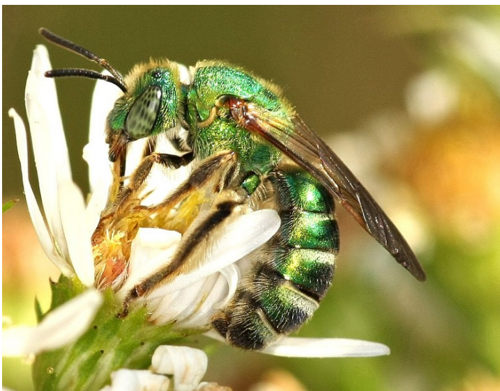
Green Metallic Bee