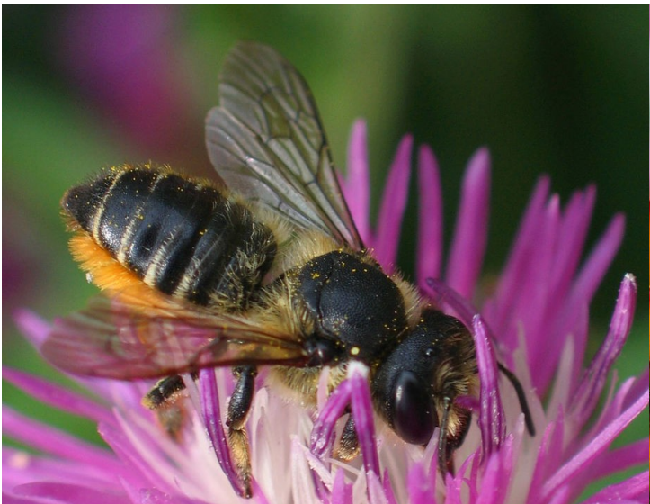
Leaf Cutter Bee