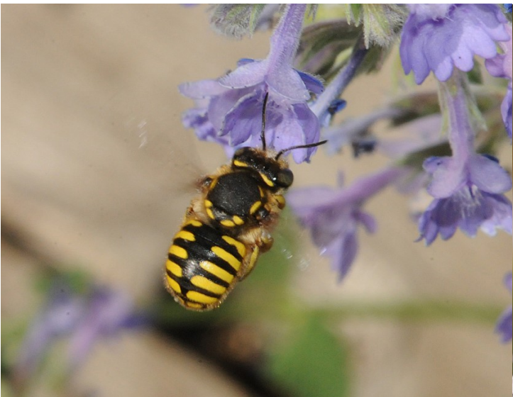
Wool Carder Bee