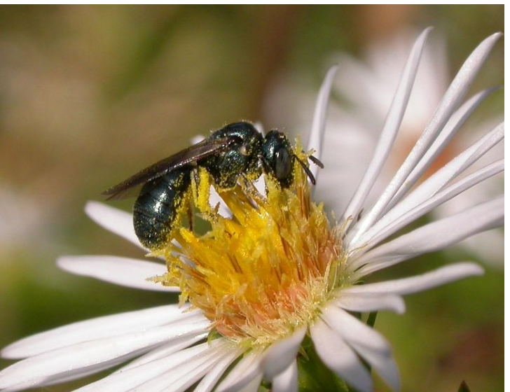
Small Carpenter Bee