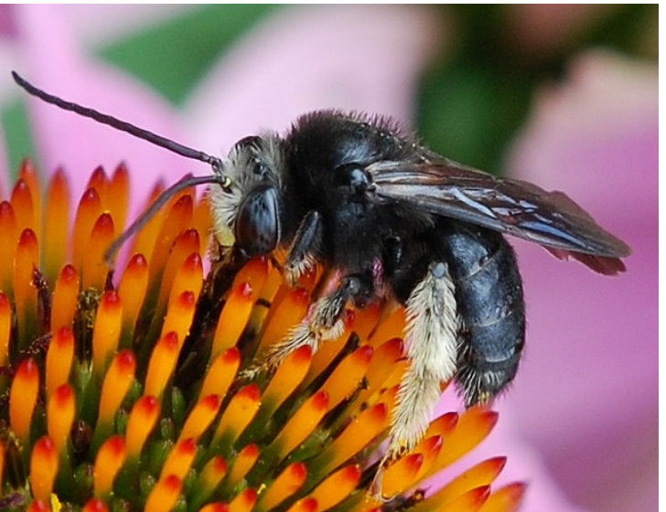
Long Horned Bee