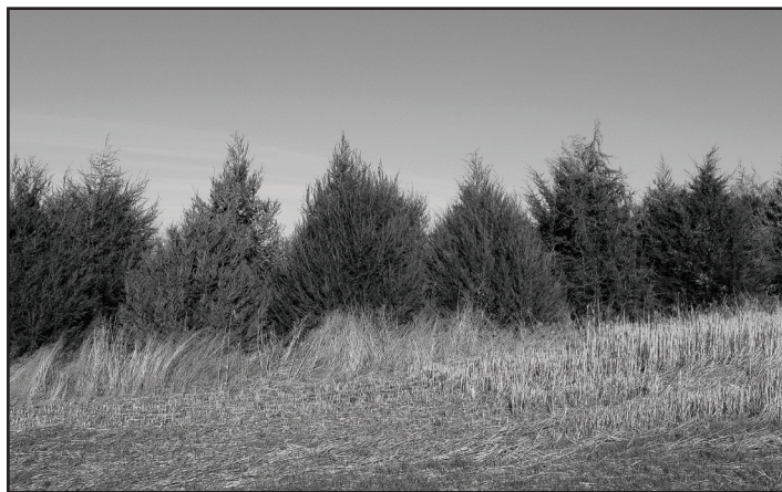
Rocky Mountain juniper after 7 years of growth are filling in and should be capable of catching and holding blowing snow.

The gaps between the trees have filled in and the living snow fence is fully functional. It should capture snow for many years. 🌲