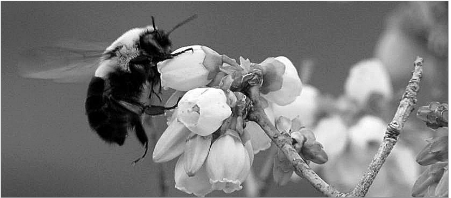
A bumblebee foraging on a blueberry blossom.