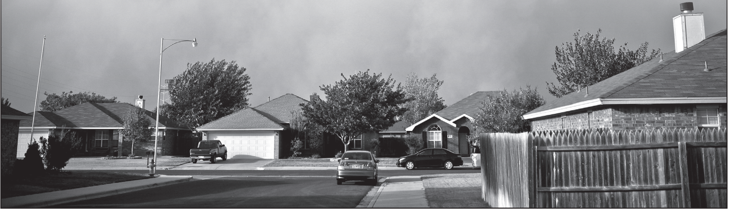
A huge cloud of dust looms over Lubbock, TX, during an October 2011 dust storm.