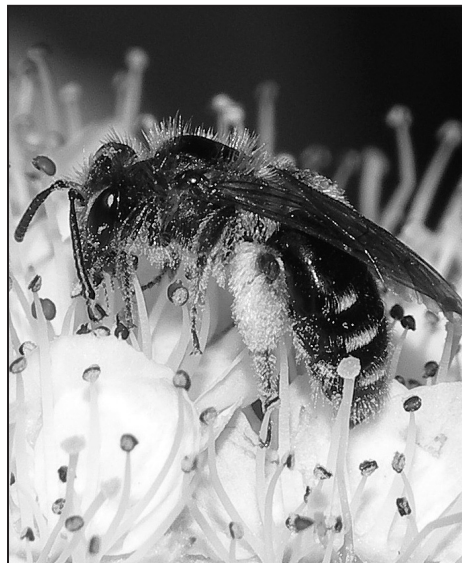
A sweat bee gathers pollen on a nine-bark.

Besides providing habitat and safety for pollinators, the additional agroforestry