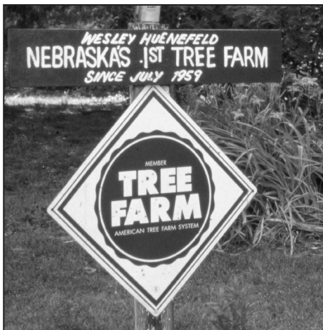
A sign on the Huenefeld farm tells a small part of the story behind the Huenefeld farm near Giltner, NE.