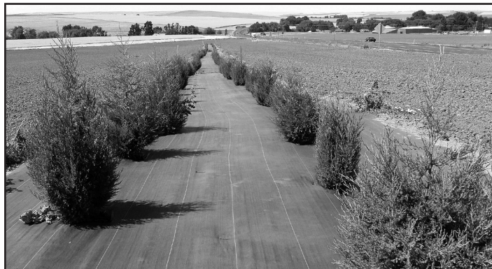
Rocky Mountain junipers were planted to make a living snow fence in Oregon.

The next step was to remove the existing snow fence structure so the site could be readied for planting. To ensure seedling survival, deep ripping the soil to break up any root restricting layers