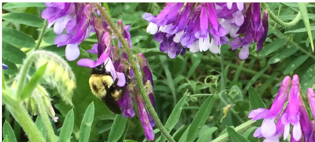
Cover crops that flower in early summer can provide wild bumble bees with pollen and nectar to help colonies build up before pumpkin bloom.

These studies suggest that combining different pollinator species can help growers ensure reliable pollination. Depending on where your farm is located, some pollination strategies may be more appropriate than others. Pumpkin pollinators, particularly wild bumble bees, benefit from access to other floral resources, especially in early spring when bumble bee queens are first starting their nests. These resources can be maintained in natural areas around the farm or added as flower plantings to field edges or as flowering cover crops within or next to fields.