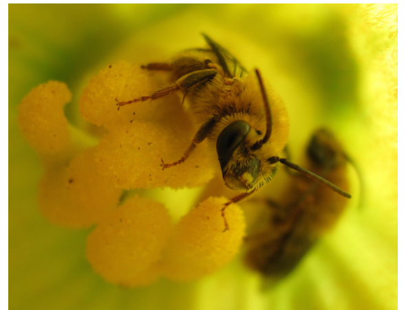
Male squash bees in a female squash flower. Squash bees are wild pumpkin pollinators that nest in and around pumpkin, squash, and gourd fields.

Research from the southwestern US shows that pumpkin pollinators can complement each other and ensure full pollination by visiting flowers at different times of the day. For example, the wild squash bee emerges early in the morning, when pumpkin flowers first open, while honey bees are more active later in the morning.