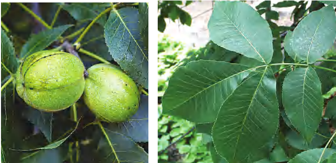
*Paul Wray, Iowa State University

Leaves are compound with 5 to 7 leaflets, but the tree has an alternate branching habit. Fruit are hard-shelled nuts in a green husk.