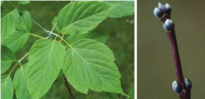
*Paul Wray, Iowa State University

Exhibits opposite branching and compound leaves. However, has 3 to 5 leaflets (instead of 5 to 11) and the samaras are always in pairs instead of single like the ash.