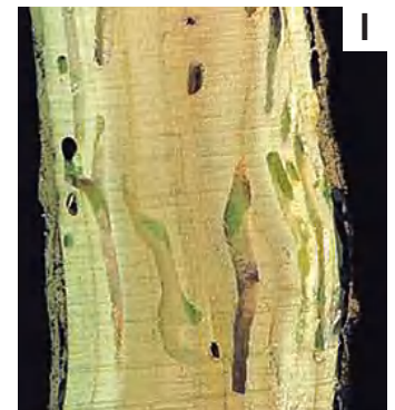
Csoka, Hungary For Res Inst., www.forestryimages.com