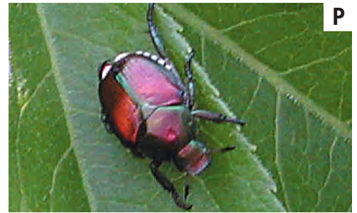
Michigan State University