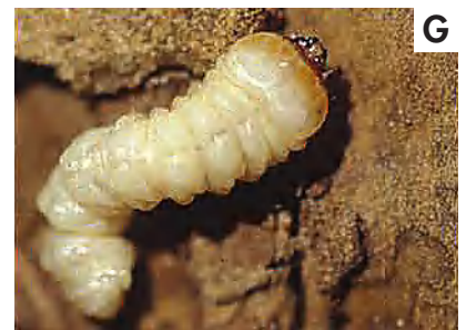
D. Herms, Ohio State University/OARDC

Native ash borers are North American insects that tunnel under the bark of ash trees, sometimes causing enough damage to seriously weaken trees.