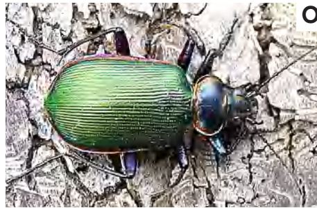
University of Arkansas