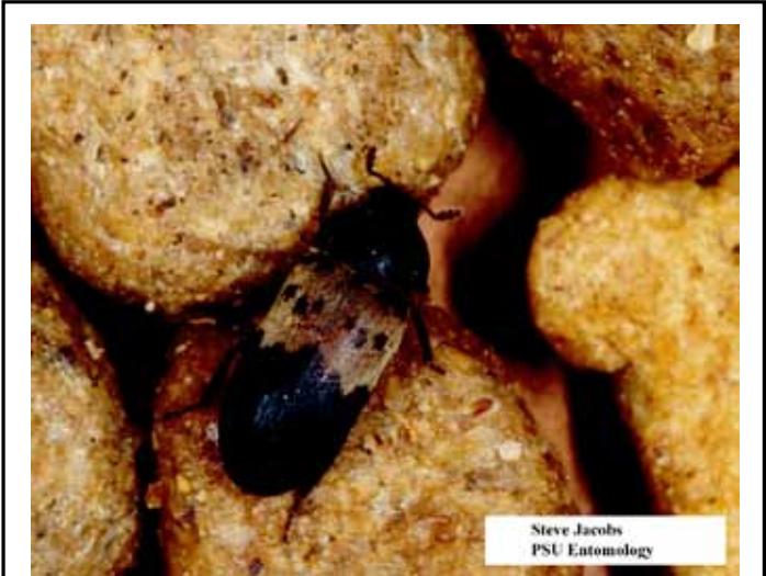
Figure 1. Larder beetle adult

Larder beetles often overwinter in crevices of bark or other sheltered places. In early spring, the beetles are attracted to dead insects and will enter the house to oviposit. Through the summer months, females lay more than 100 eggs; the incubation period is less than 12 days. The larvae, preferring spoiled meat, will feed constantly until the next to last molt. They may molt up to five times if male, and six if female. When ready to pupate, the larvae will tunnel into anything in the immediate vicinity, preferring the food source. The pupal stage lasts from 3-7 days depending on temperature and moisture conditions. If conditions are ideal, a generation may be completed in 40-50 days.