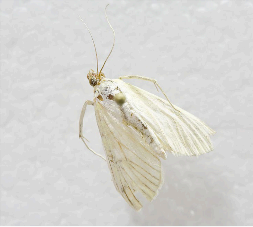
Figure 1. S. palealis (mounted specimen) collected from Centre County, Pennsylvania during 2011.