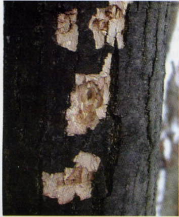
Figure 6. Jagged holes left by woodpeckers feeding on larvae.