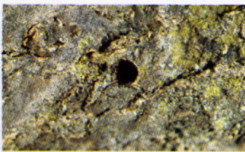
Figure 5. D-shaped hole where an adult beetle emerged.