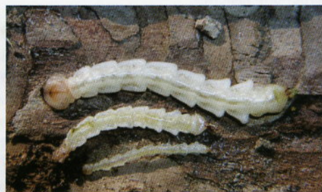
Figure 3. Second, third, and fourth stage larvae.