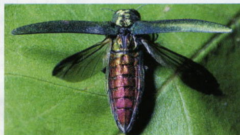
Figure 2. Purplish red abdomen on adult beetle.