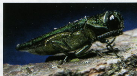
Figure 1. Adult emerald ash borer.

Prepupal larvae overwinter in shallow chambers, roughly 1 cm deep, excavated in the outer sapwood or in the bark on thick-barked trees. Pupation begins in