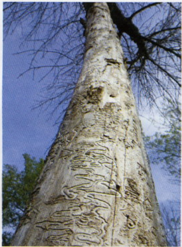
Figure 7. Ash tree killed by emerald ash borer. Note the serpentine galleries.