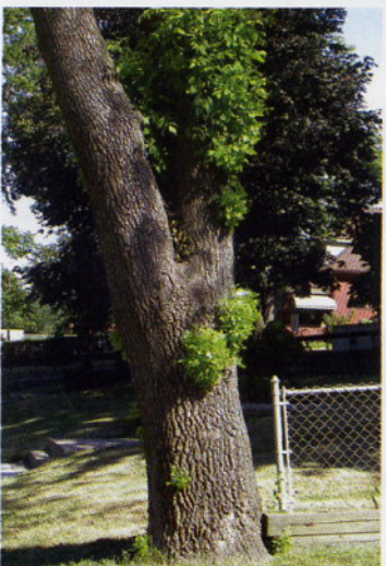
Figure 8. Epicormic branching on a heavily infested ash tree.

late April or May. Newly eclosed adults often remain in the pupal chamber or bark for 1 to 2 weeks before emerging head-first through a D-shaped exit hole that is 3 to 4 mm in diameter (Fig. 5).